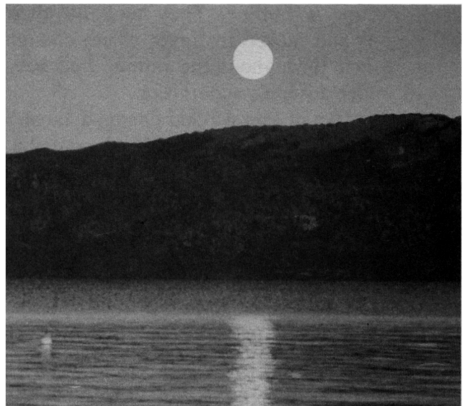
A full moon as it appears on the fifteenth day of the seventh month.

Then what were the Israelites to do with the lamb? (Exodus 12:8) _____