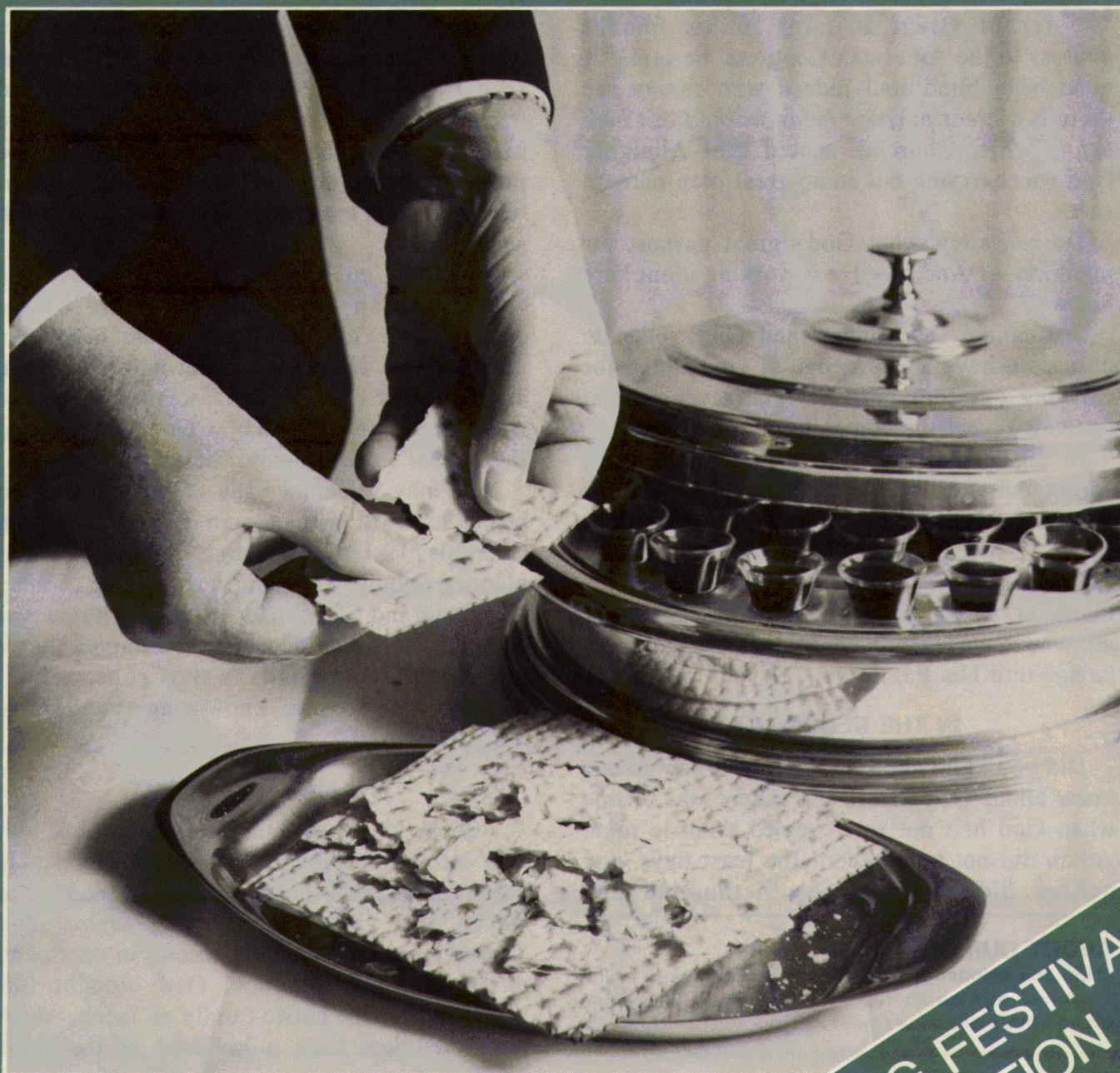
The Spring Feasts