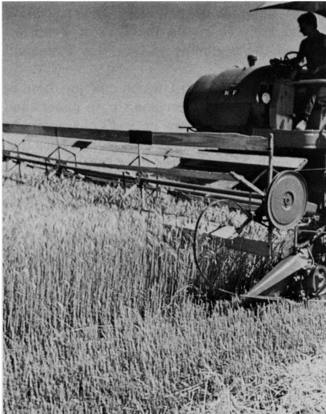
Kansas Wheat Improvement Assoc.

Leaven is used in the Bible as a symbol of sin. Paul said a little leaven leavens the whole lump (I Corinthians 5:6). Just as a little bit of yeast makes a whole batch of dough light and airy, so just a little bit of sin will spread in our